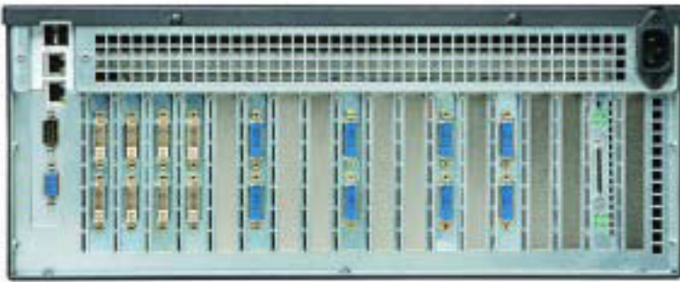
(rear panel of the Fusion Catalyst 4000)